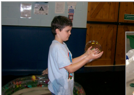
Blue Week's Bubble session

Recently Blue Week (for high functioning children) have welcomed Mr Fluffy to circle time. Mr Fluffy hopes to promote friendships, communication and imagination by the children choosing who to pass the teddy to and participating in new activities.