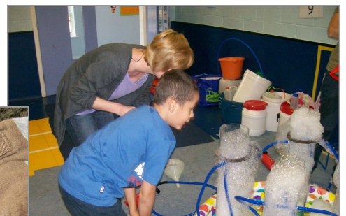
Blue Week's Bubble session